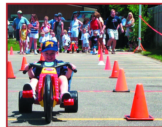
Lake Mills Optimist Club Big Wheel Race