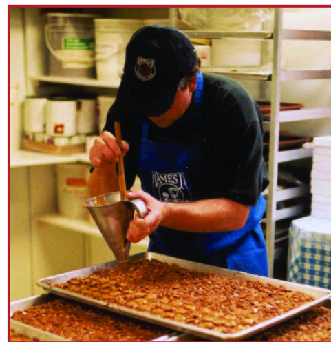
James J. Chocolate Shop