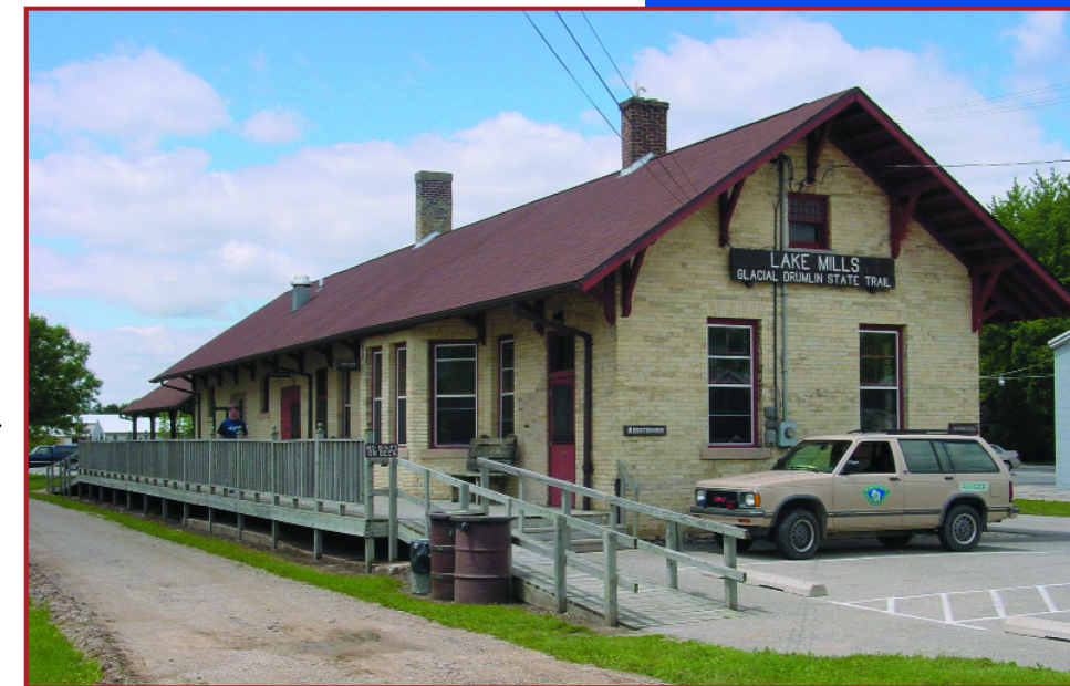
Glacial Drumlin State Bike Trail

This park contains one of Wisconsin's most important archaeological sites. The park showcases an ancient middle-Mississippian village and ceremonial complex that thrived between 1000-1300 A.D.