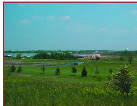
Lake Mills Business Park & Tyranena Golf Club

For more information: Industrial and commercial parcels in the Lake Mills Business Park are available through