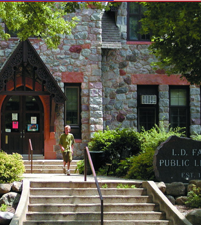
L.D. Fargo Public Library