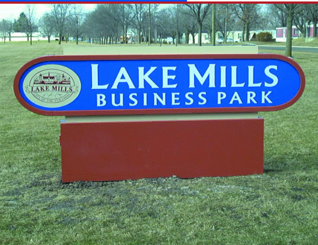
Lake Mills Business Park

We invite you to consider the Lake Mills Business Park.