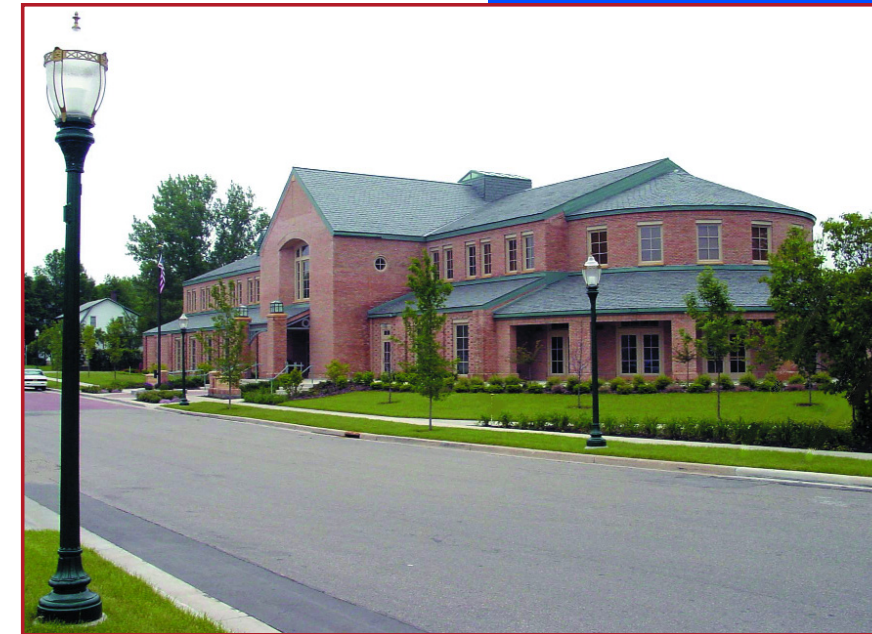
Lake Mills City Hall