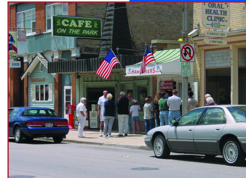
Downtown Lake Mills